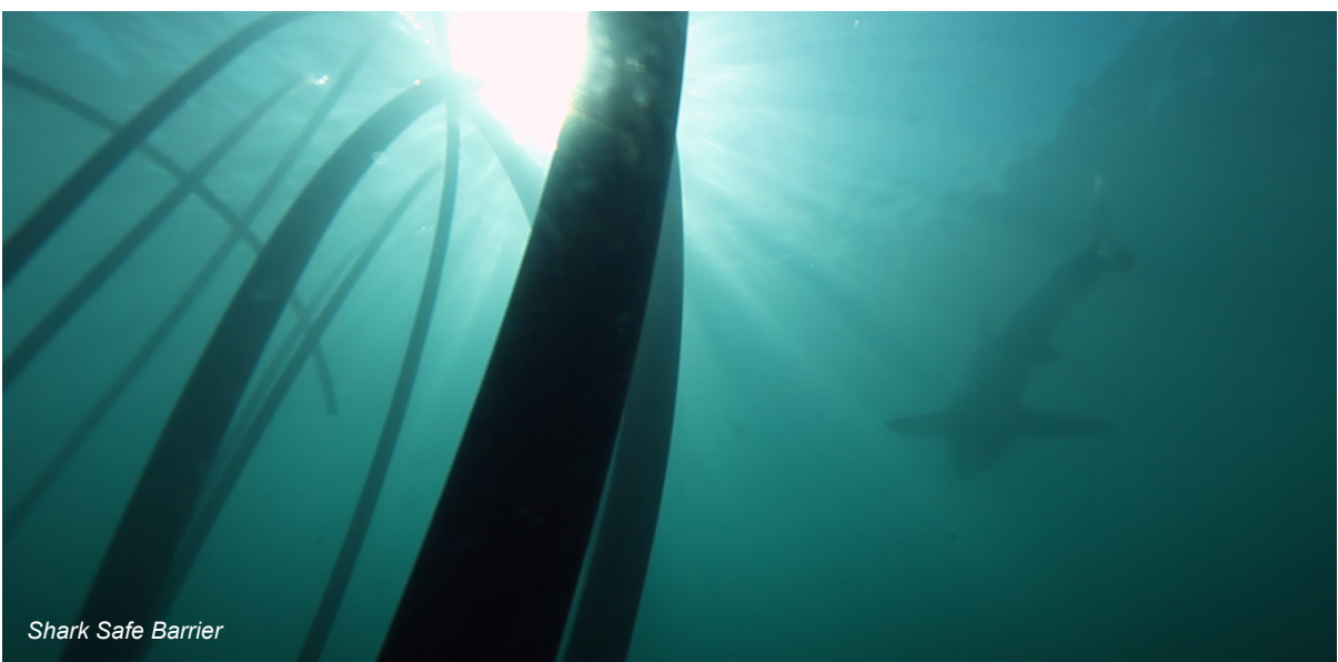
Shark Safe Barrier